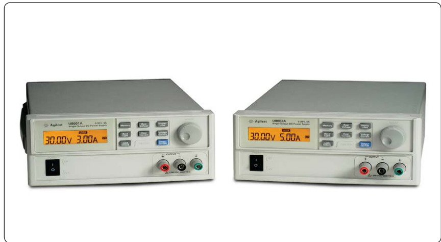
Figure 1. The U8001A 90 W and U8002A 150 W single output DC power supplies