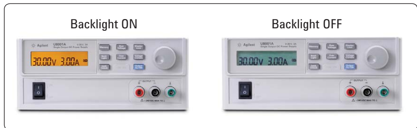
Figure 2. Backlight on/off options for LCD display