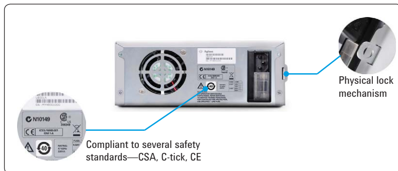
Figure 3. Safety and security features of the U8000 Series single output DC power supplies